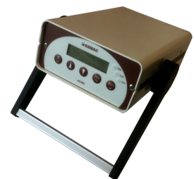
Display unit AZ1000